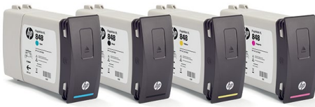
8 HP PageWide XL ink cartridges (2 x 400-ml per color with auto-switch)

The HP PageWide XL 5000 Printer series includes a stationary 40-inch (101.6-cm) printbar that spans the whole printing width. As paper moves under the printbar, the entire page is printed in one pass, enabling very high printing speeds.