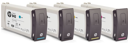
8 (2 x 775-ml per color with auto-switch)