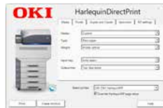
Harlequin MultiRIP 10