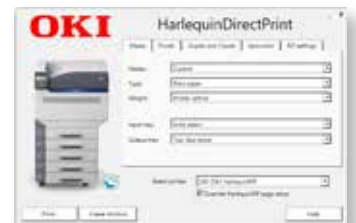
Harlequin MultiRIP 10